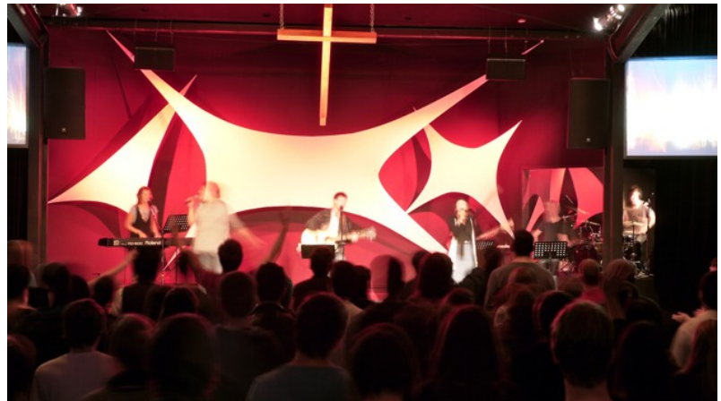
A recent city wide youth event which THOP oversees called Emerge