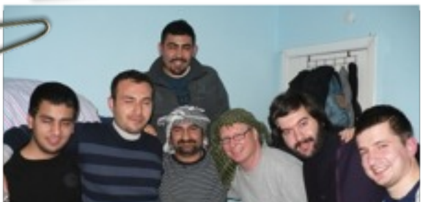
Spending the afternoon with new friends

And, finally, we traveled around the world to bring the Message ourselves. The need is great—most students never have the opportunity to meet a Christ-follower since there is only one small church in this city of 4 million. We met students & initiated spiritual conversations to find those who were open spiritually and pass them on to the long-term team. It is a privilege to be a part of God's mission to the people of the Middle East.